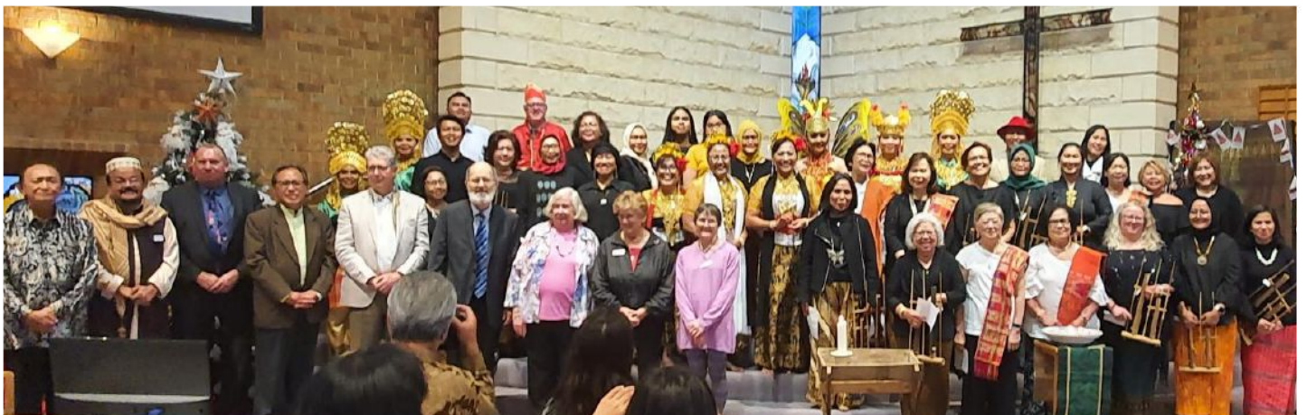
2019 Intercultural Christmas Celebration

be seen other than as a deeply ingrained cultural prejudice against an 'outsider' to the chosen people? What message does it have for us that by transcending the rules about purity, Jesus saw the woman, talked to the woman, heard her voice and healed her daughter? Was Jesus' own understanding transformed by the courage and humility of the 'outsider'? This insight was inspiring: highlighting Jesus' acceptance and willingness to truly see, hear and respect people whether they were Jews or Gentiles.