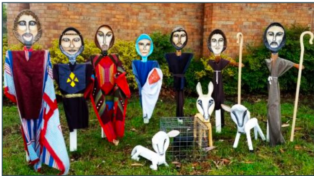
Spoonville Nativity Scene

CHRISTMAS STORY: Click on https://youtu.be/MGy8MjPN5n4