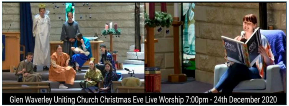
Glen Waverley Uniting Church Christmas Eve Live Worship 7:00pm - 24th December 2020

Just in case you missed these great creative moments over Christmas: