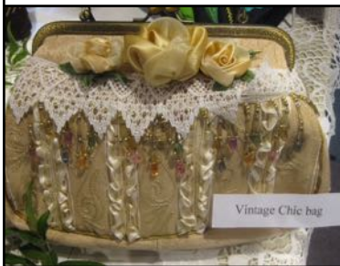
Vintage Chic bag

The quality of the work was awe-inspiring. A very young 94-year-old was very willing to show and explain her unbelievable hardanger work; another showed us how to make a beautiful flower arrangement; and two men showed products of their woodwork skills, including stools, palm crosses, and a chess set. There were paintings, clothes designs, patchwork quilts, spinning, and embroidery. Demonstrations of making stars (for the One Million Stars to End Violence project) invited visitors to add their stars to the collection.