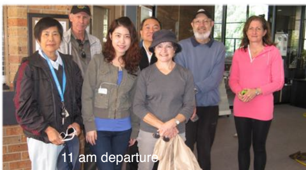
11 am departure